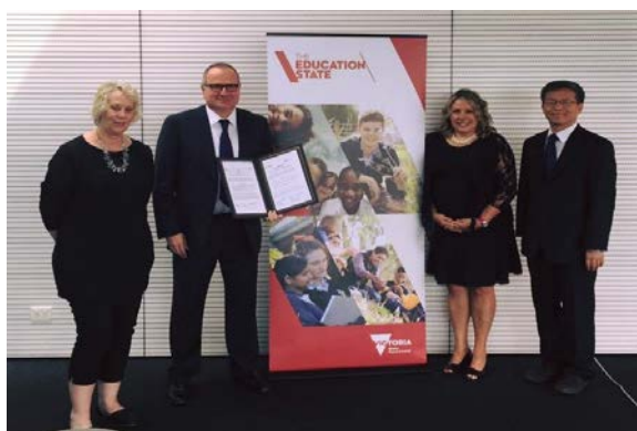
The MOU between the Daegu Metropolitan Office of Education and the South West Victoria Region of Victoria was signed in 2015.

'The Global LYNCs project provides authentic learning opportunities for schools while promoting global citizenship through engaging students in multicultural curriculum based activities. Students are provided with opportunities to gain a sense of Australia's and Korea's role in the global community.'