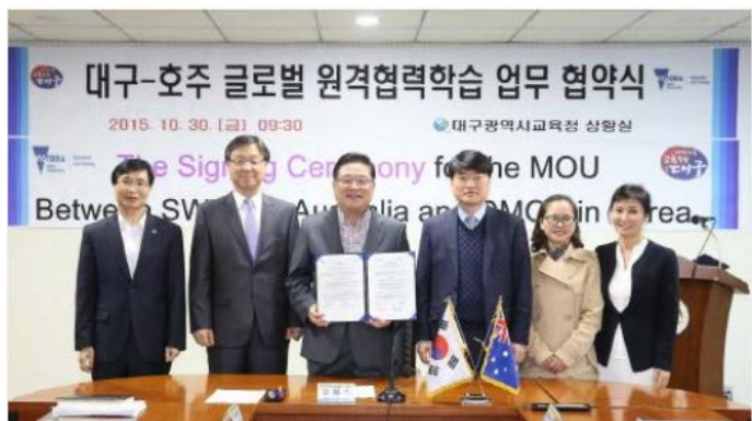
(Left) As featured on South Korean television. (Above) Celebrating the MOU signed with the SWVR DET Victoria.